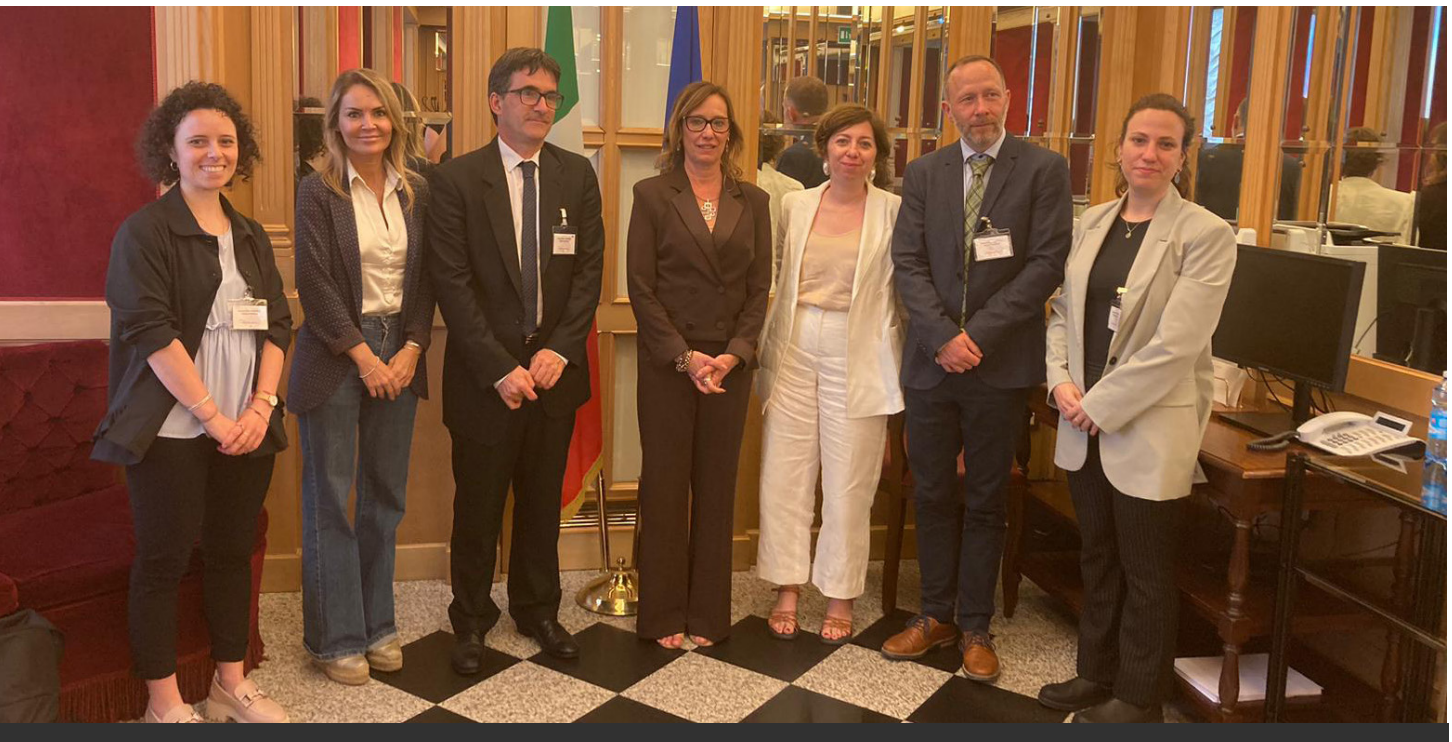
MFRR delegation with Vice President of the Justice Commission at the Italian Senate, Senator Ilaria Cucchi

The MFRR partners had the opportunity to discuss the matter with Senator Ilaria Cucchi , Vice President of the Justice Commission of the Italian Senate, which is overseeing the bill's discussions. Senator Cucchi expressed concern that media freedom is under threat in Italy. During the discussion, it became evident that the Balboni Bill is unlikely to undergo substantial amendments in its current form, as it has the support of the majority of MPs in the governing coalition.