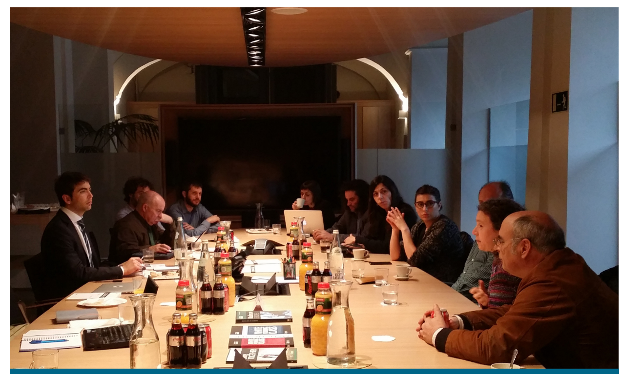
Members of the international delegation meet with journalists from Catalonia at the offices of the Open Society Initiative for Europe on Dec. 3, 2014 in Barcelona.